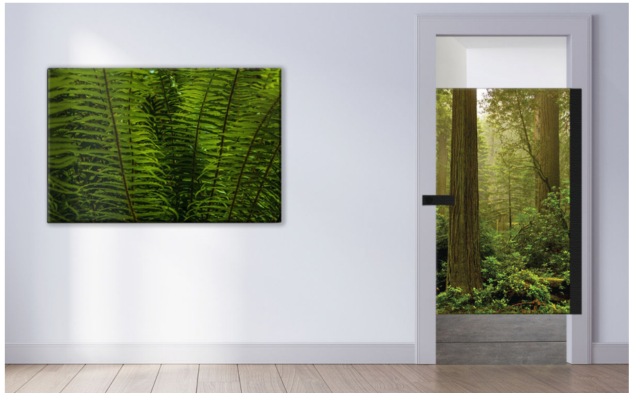
Kennon Art (left) and Kennon Original SSPD (right)